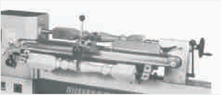
KA-90 with original scanning